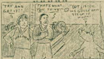
BOSTON ILA BACKS WEST COAST

This is only half of it. One of the crews who had been listening to a radio on the ship reported that a local scab news radio station had stated that the crew of the Harpoon were scabs and therefore, the local longshoremen had refused to work the ship. This was done of course to create public opinion against the militant seaman. Aroused by this slanderous statement the crew sent an ultimatum to the radio station to the effect that if a retraction was not made on the one o'clock news flash, THE PLACE WOULD BE PICKETED. At one o'clock the station retracted their statement and said they had gotten the false information from the police department. You can bet that the New Bedford ILA local will be one more local that will back the West Coast unions when the time comes after this splendid display of real solidarity.