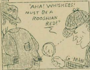
WILL RESIGNS FROM COUNCIL

It is only through a real honest to goodness Farmer-Labor Party that waterfront workers can find protection against this thinly veiled "Fascism". To this end we must all take active part in seeing to it that our local solidly supports the Farmer-Labor Party when the call comes.