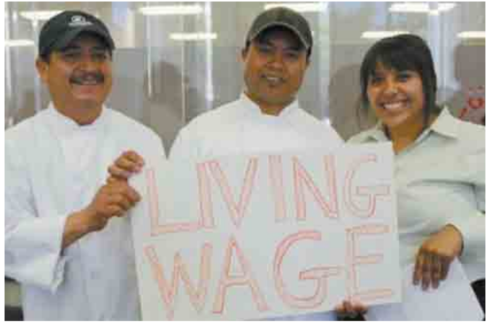
Long Beach living wage: A living wage measure for Long Beach, CA hotel workers passed with more than 60% of the vote. The city's hotels will be required to pay workers a rate that is $4 more than California minimum wage and provide them with five sick days each year.

"Proposition 32 was designed by extremists to cripple unions in California, and it would have spread nationwide if we didn't defeat it here first," explained President Cortez.