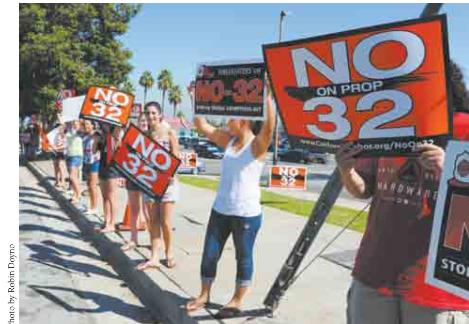
Human billboard: Leading up to November 6, ILWU members and community supporters formed a human billboard in San Pedro to get the word out about Prop 32.