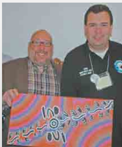
22nd IBU Convention report. page 4