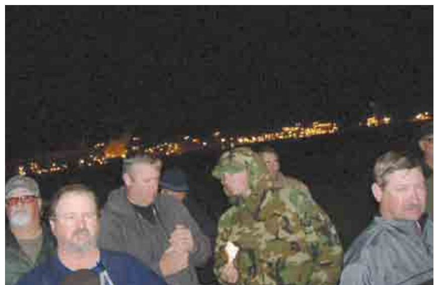
Union members mark the anniversary of the 2010 lockout by Rio Tinto with a vigil.