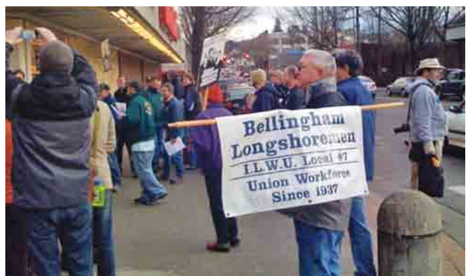
International Longshore and Warehouse Union participants in the Bellingham, WA action show their support for Rite Aid workers during the National Day of Action in December. Another national mobilization is planned around Valentine's Day.

The problem started back in 2008 when Rite Aid violated the rights of 550 employees by sending them home early. Another 46 workers were illegally laid-off.