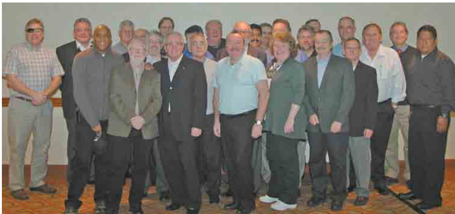
ICEM North America regions representatives meeting in San Francisco, CA