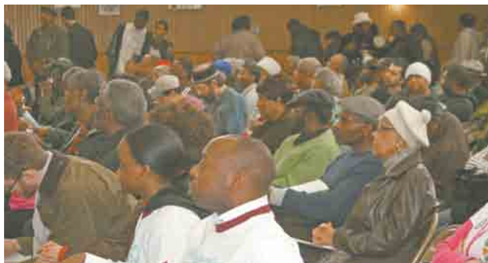
The Local 6 hall in Oakland, CA was standing-room only.