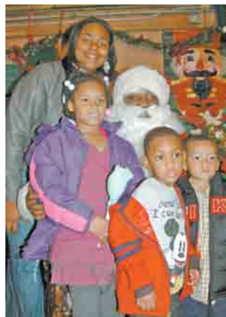
Santa took time out of his busy holiday schedule to join the Local 10 party.