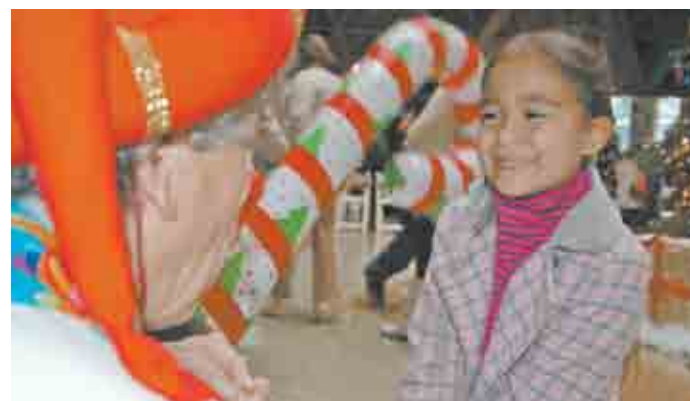
ILWU Local 10's holiday party included lots of entertainment for the kids.