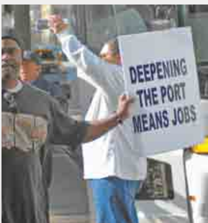
The LA City Council voted to continue the harbor deepening project without delay. ILWU members packed the council meeting to stand in support of the dredging which will protect thousands of jobs in the harbor community. page 5