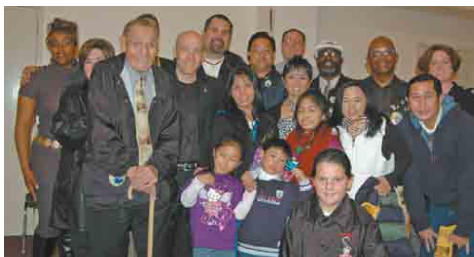
ILWU members, pensioners, and their families at the San Francisco MLK Labor breakfast.