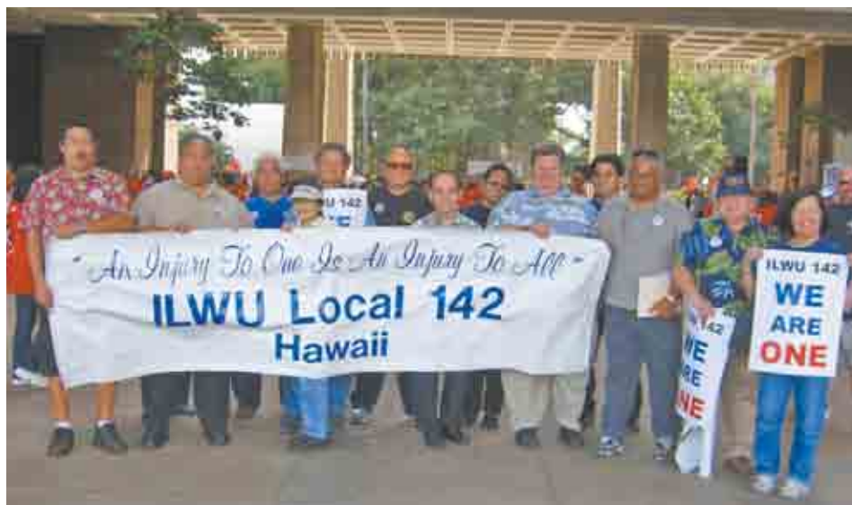
Local 142 members joined along with more than 1,000 people in the solidarity rally in Honolulu

labor rallies that Washington State has seen in a decade. Over 12,000 people came to the State Capitol in Olympia to urge that legislators “Put People First.” Speakers at the event denounced the increasing attack on public workers, including employees at the Washington State Ferry system who belong to the IBU and are in the crosshairs of anti-union politicians (see story on page 5). Calls to “tax the rich” instead of attacking workers were heard frequently among speakers.