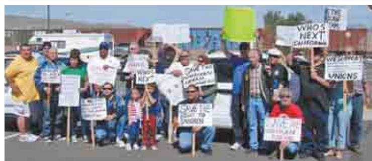
Local 30 members organized Wisconsin solidarity actions at Palmdale and Barstow, CA in early March.