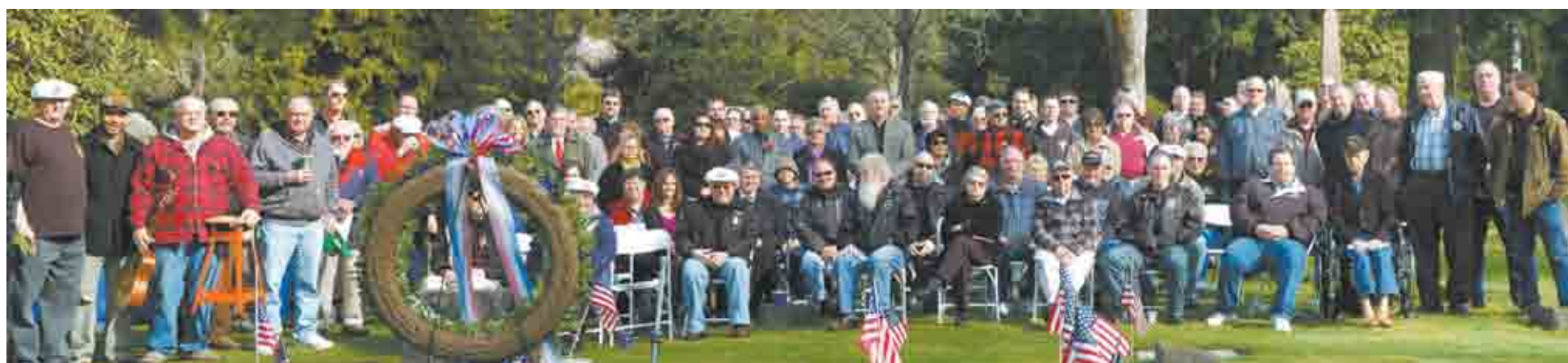
There was an impressive turnout for the ceremony at the Old Tacoma Cemetery.