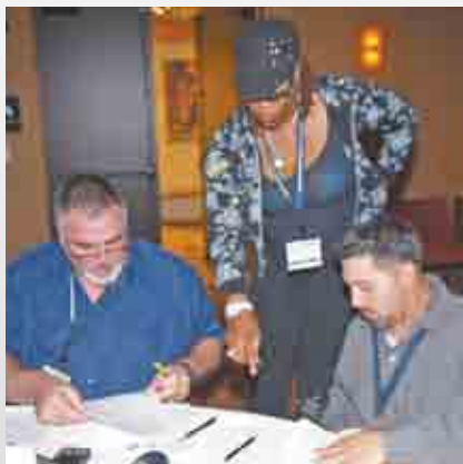
ILWU Coast Longshore Division's Grievance and Arbitration Process training fills the GAP. page 7