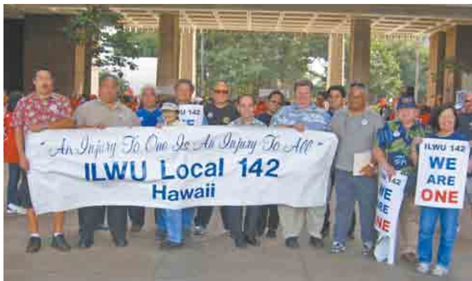
Local 142 members joined along with more than 1,000 people in the solidarity rally in Honolulu

labor rallies that Washington State has seen in a decade. Over 12,000 people came to the State Capitol in Olympia to urge that legislators “Put People First.” Speakers at the event denounced the increasing attack on public workers, including employees at the Washington State Ferry system who belong to the IBU and are in the crosshairs of anti-union politicians (see story on page 5). Calls to “tax the rich” instead of attacking workers were heard frequently among speakers.